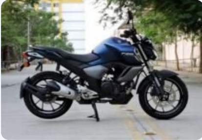
Yamaha FZS-FI V 3.0 150cc 2020