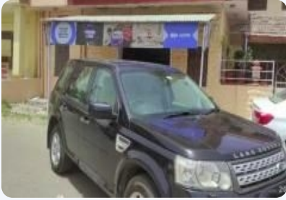
Land Rover Freelander 2 TD4 SE 2012