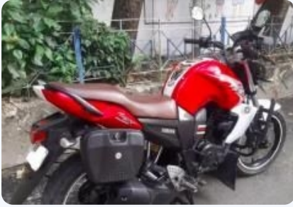
Yamaha FZs 150cc 2013