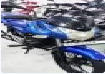
Bajaj Discover 100cc 2013