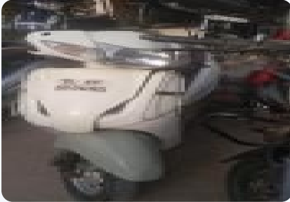
Honda Activa 110cc 2011