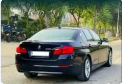
BMW 5 Series 520d 2011