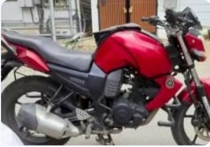
Yamaha FZ16 150cc 2013