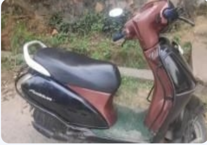
Honda Activa 110cc 2014