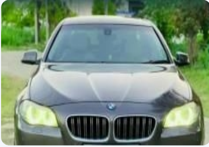
BMW 5 Series 520d 2012