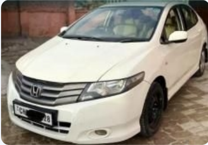
Honda City 1.5 V AT 2009