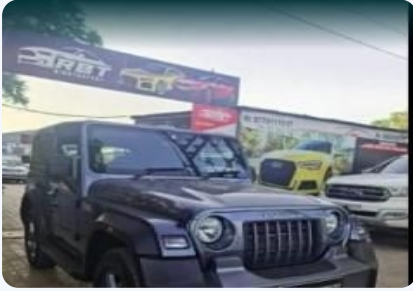
Mahindra Thar LX 4 STR Hard Top Diesel AT BS6 2021