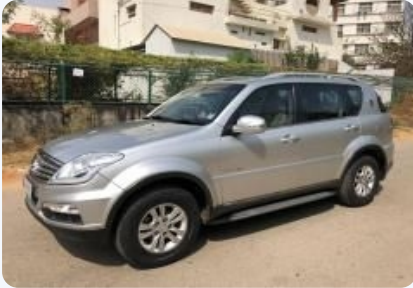
Mahindra Ssangyong Rexton RX7 2014