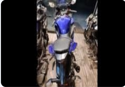
Yamaha YZF-R15 V3 150cc ABS Racing Blue BS6 2021