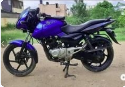
Bajaj Pulsar 150cc 2012