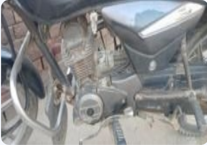
Bajaj Platina 100cc 2009