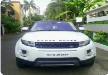
Land Rover Range Rover 4.4 SDV8 VOGUE SE 2013