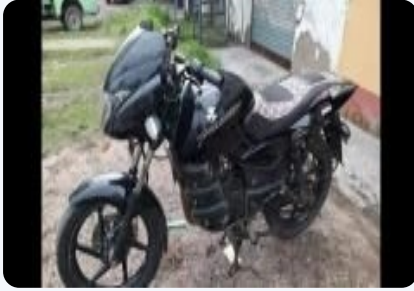
Bajaj Pulsar 150cc 2009