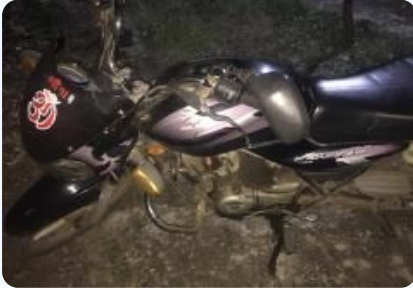
Bajaj Discover 125cc 2006