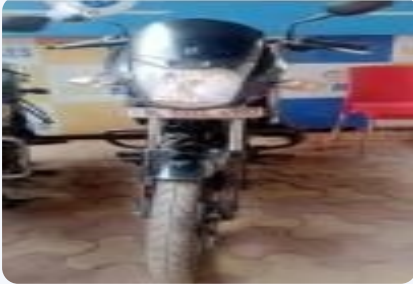
Hero Passion Pro 13S Alloy 100cc Disc BS6 2020