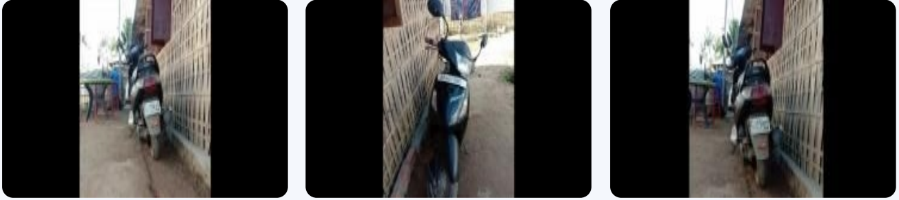
Hero Pleasure 100cc 2010