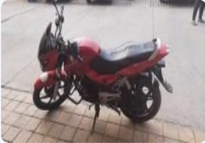
Bajaj Pulsar 180cc 2007