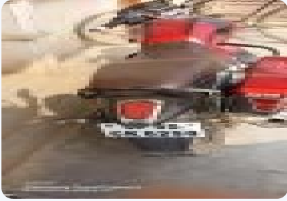
Bajaj V15 150cc 2016