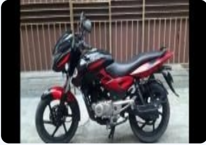
Bajaj Pulsar 150cc 2013