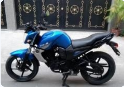
Yamaha FZs 150cc 2011