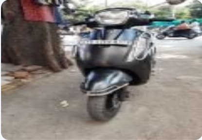
Suzuki Access 125cc 2019