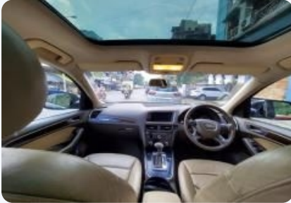
Audi Q5 2.0 TDI QUATTRO 2013