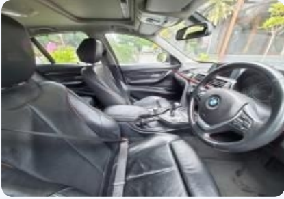
BMW 3 Series 320 D 2013