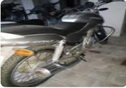
Bajaj Pulsar 150cc 2004