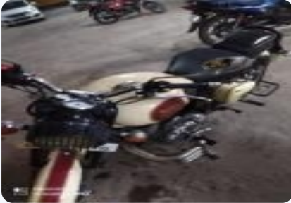
Royal Enfield Classic 500cc 2017