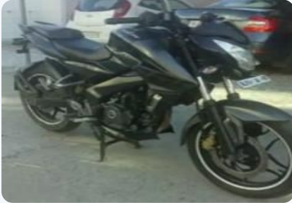
Bajaj Pulsar NS200 ABS 2018