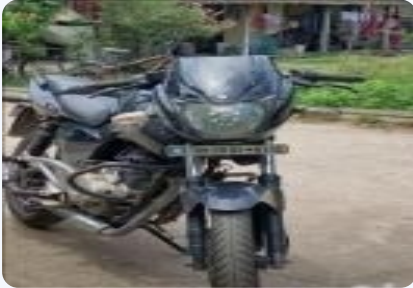
Bajaj Pulsar 180cc 2012