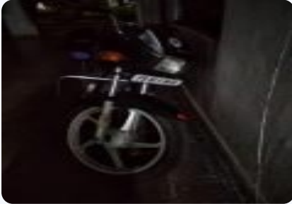
Hero Honda Splendor Plus 100cc 2011