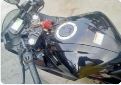
Suzuki Gixxer SF 150cc ABS BS6 2021