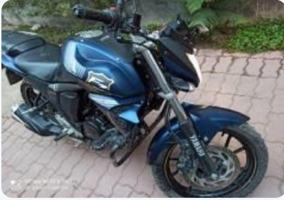
Yamaha FZS FI 150cc Rear Disc 2019