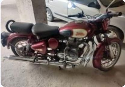
Royal Enfield Classic 500cc 2010