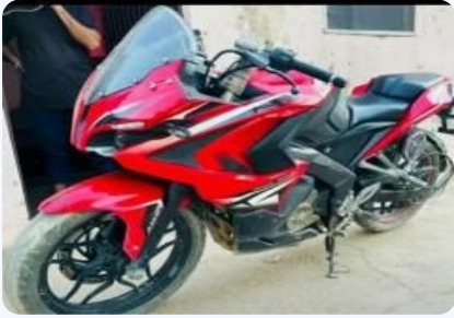
Bajaj Pulsar RS200 2016