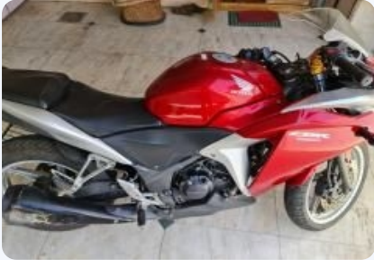
Honda CBR 250R 2013