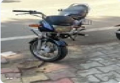
Hero Passion Plus 100cc 2008