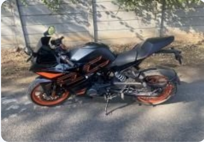
KTM RC 200cc ABS BS6 2020