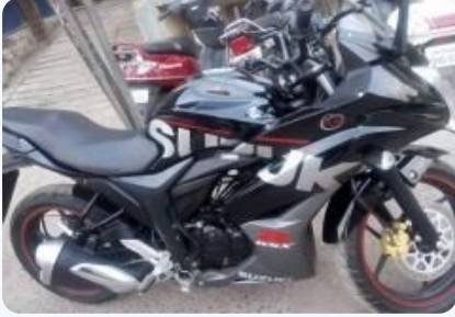
Suzuki Gixxer SF 150cc 2015