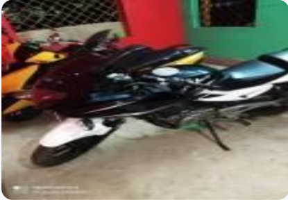
Bajaj Pulsar 220F 2017