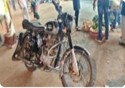
Royal Enfield Classic Chrome 500cc 2016