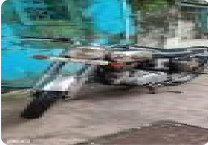
Royal Enfield Classic Chrome 500cc 2016