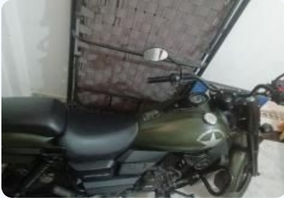
UM Renegade Commando 2018