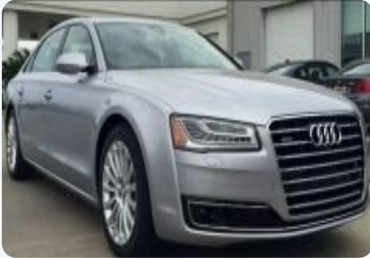
Audi A8 L 60 TFSI 2018