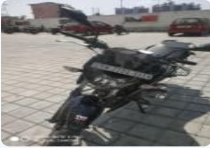
TVS Apache RTR 160 4V FI ABS 2019