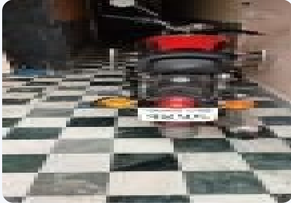
Royal Enfield Classic 350cc-Redditch Edition 2019