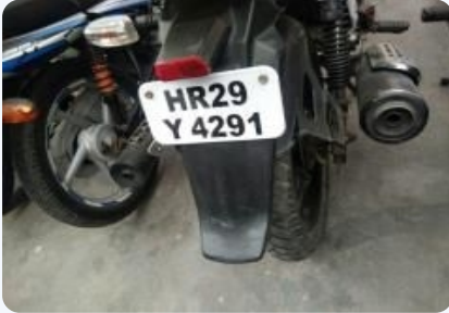
Bajaj Pulsar 150cc 2010