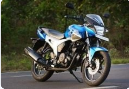
Yamaha SZR 150cc 2013