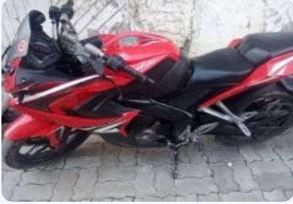
Bajaj Pulsar RS200 ABS 2015